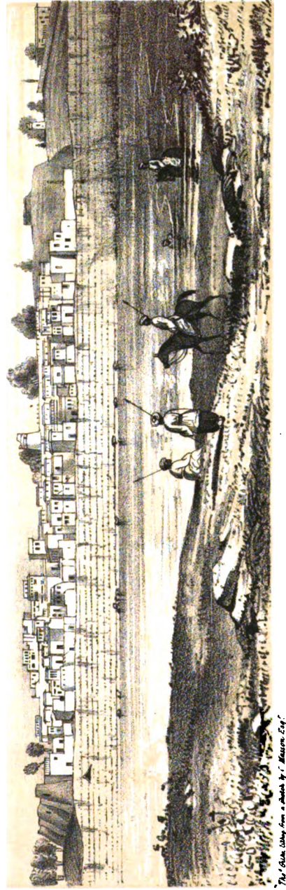
VIEW of BALLABAGH from the NORTH near JELALABAD.

London Richard Bentley, New Burlington Street. 1842