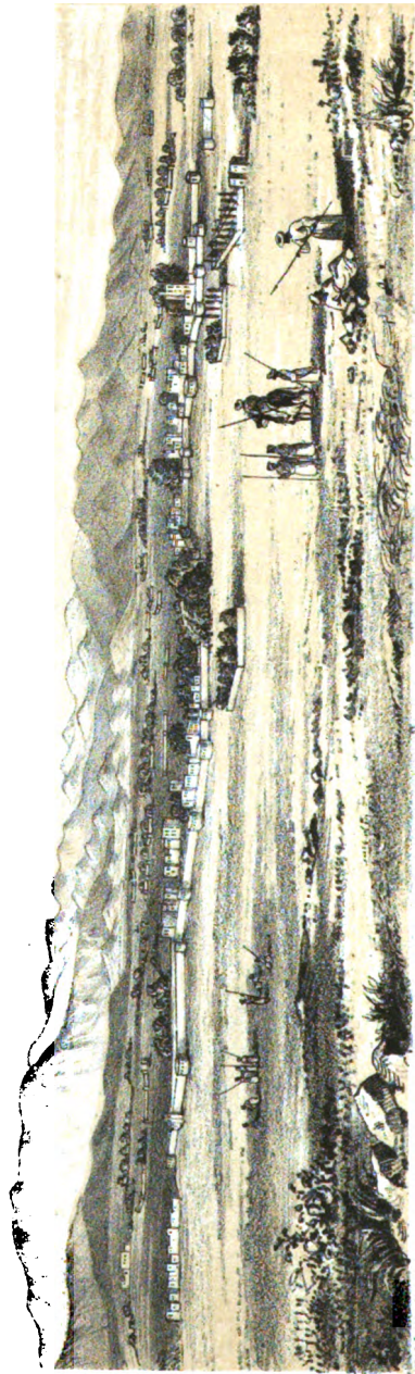
The Valley looking from a distance from Jelalabad.